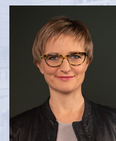
Dr. Franziska Brantner

Supports the minister in his political and policy work Federal Government Commissioner for Small and Medium-Sized Enterprises